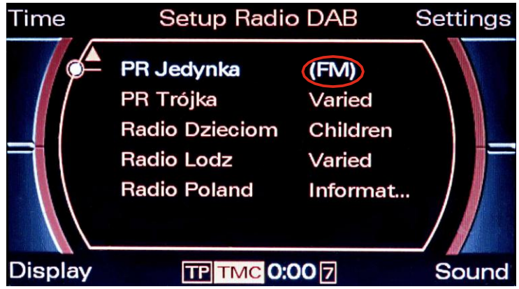
An example of the operation of the Service Following function fig.9